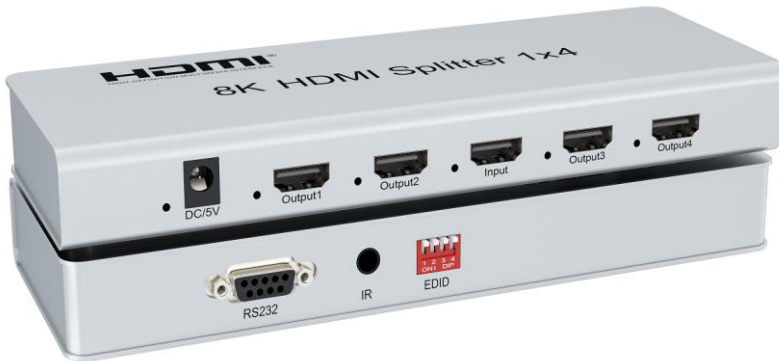
AC-HDSP8K-4 4 ports 8K HDMI Splitter

Advance Connex 1 x 4 uncompressed video HDMI Splitter come with a single HDMI source and display to multiple HDMI display devices, support max 8K resolution (7680 x 4320, 60Hz).