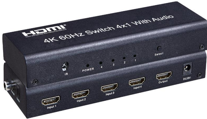
AC-HDSW4-N2.0 4 x1 HDMI Switcher

Advance Connex 4x1 HDMI UltraHD 4K resolution switcher routes high definition video and digital audio from any one of the four sources to a single display units. Four inputs accommodate the connections of four high definition video sources simultaneously, such as satellite systems and HD DVD players. The output sends the high definition audio/video signals to a high definition display. Switching is done via the IR remote that is provided with the unit.