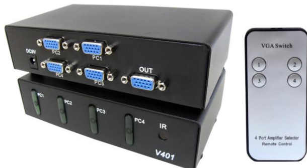
AC-401 4 x1 ports VGA Switch

AdvanceConnex 4 in 1 out computers share a monitor synchronous, up to 350MHz bandwidth with remote control, Ideal for classrooms, stock information display, and many other applications.