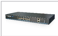
16 Ports Managed PoE Switch AC-SW16-L2